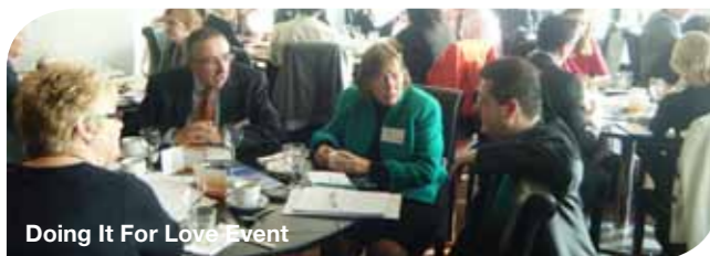
Doing It For Love Event

For the voluntary sector generally it has been a time of 'stretch and strain' with rising demand for services as the recession and rising unemployment has increasingly impacted on peoples lives. This is alongside resource pressures ranging from reduced public sector funding, greater competition for scarce charitable trust funds and declining donations by both businesses and the general public. A number of major funding streams came to an end on 31st March 2011 and as a sector we are largely at the 'end of the food chain' for decision making as the implications of the autumn and winter public funding settlements and associated policy priorities work their way through from national government level to local public bodies. Those in turn have grappled with how to do all they need to do whilst balancing the books and simultaneously restructuring and reducing staffing.